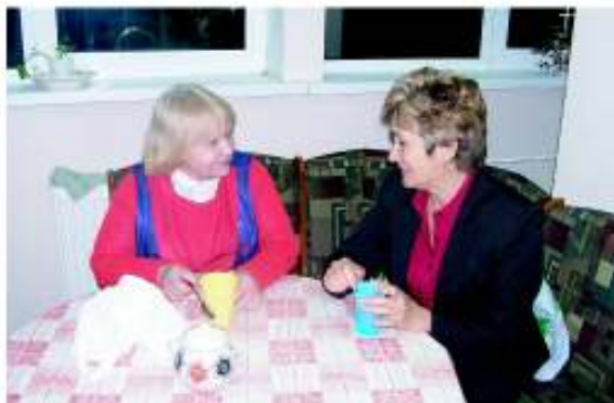
Pictured on the left: older patrons enjoying a cup of warm tea and a conversation in the UEC kitchen.