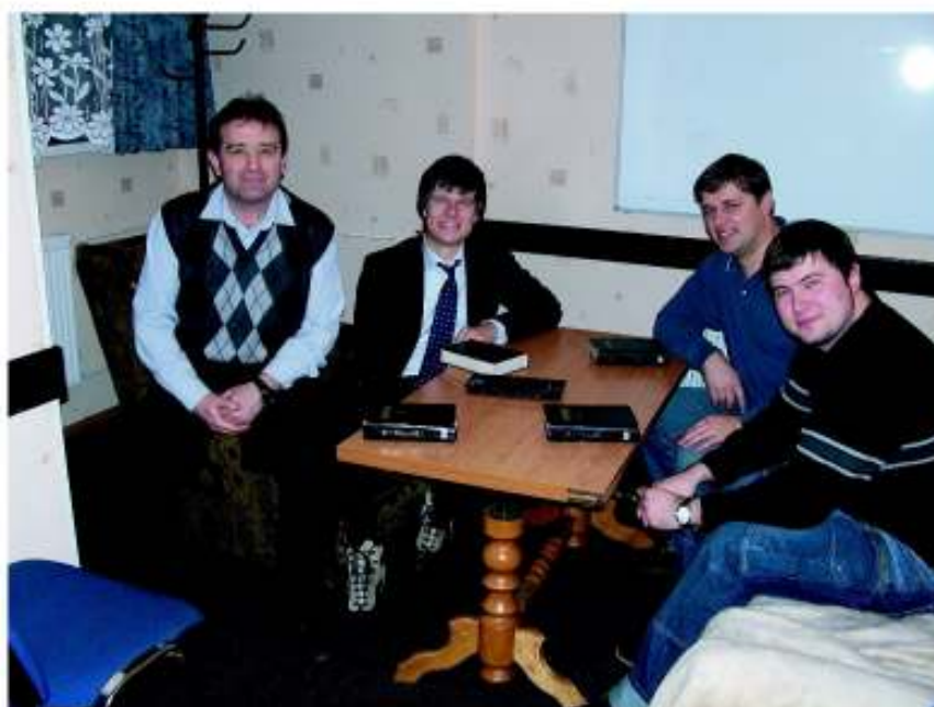
Four preachers from Nivky church meet for a weekly encouragement at the UEC

to him we were able to have more formal teaching on the proofs of Bible's uniqueness and validity, which spurred even more interest and further discussion. This study now has a life of its own and we are very thankful to God for enabling us have this time when anyone interested in spiritual matters can come and receive real nourishment for their minds and souls.