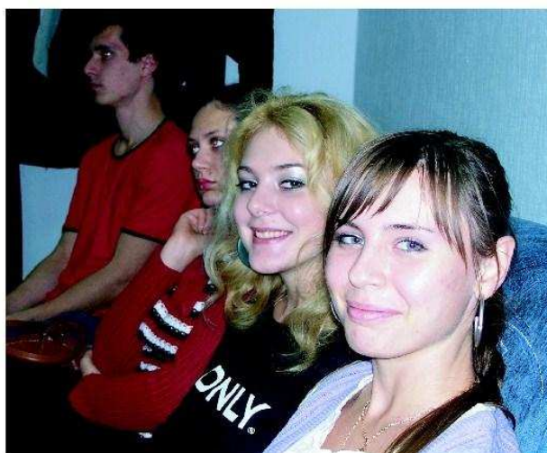
Students at the UEC anniversary