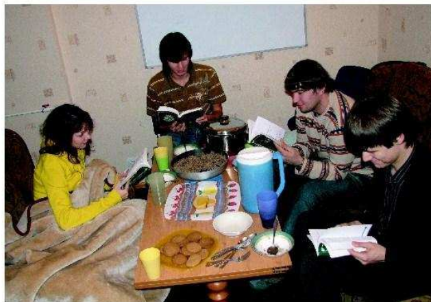
Nivky Church small group meeting on a Wednesday night